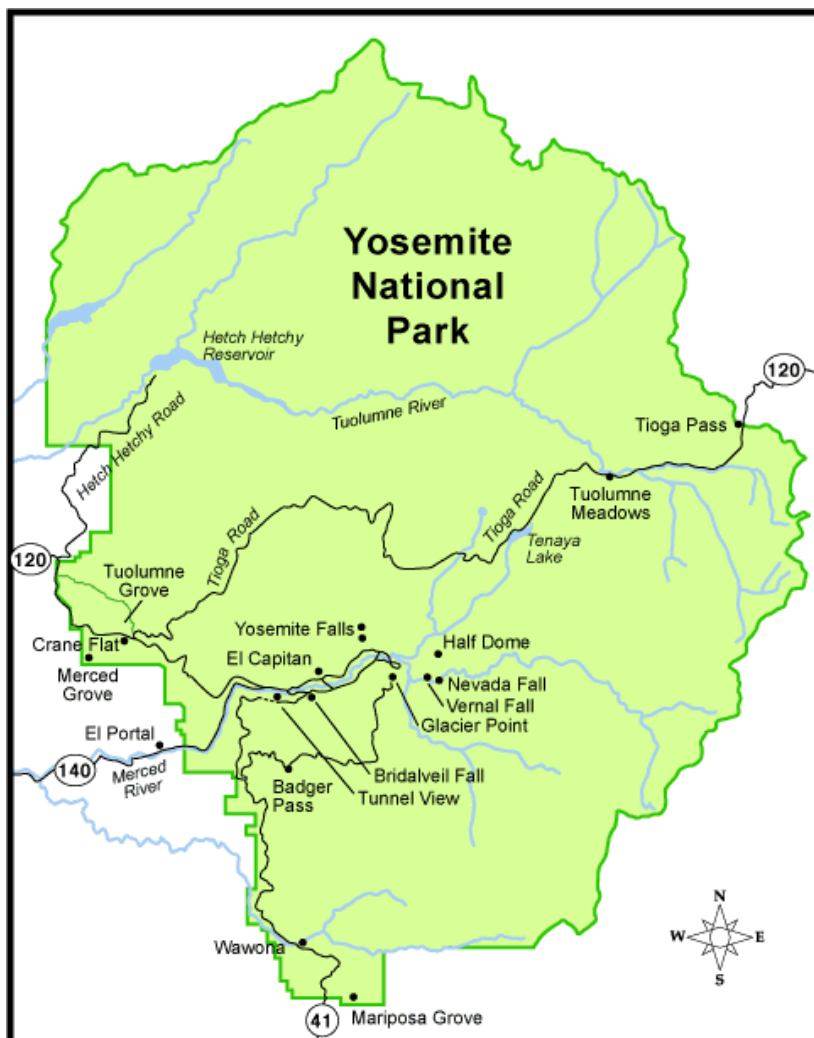
FIGURE 2. Map of Yosemite National Park.

Visitor surveys were conducted in Yosemite Valley during the summers of 1998 and 1999 to assist the NPS in formulating indicators and standards of quality for popular recreation sites, including Yosemite Falls, Bridalveil Fall, and the trail to Vernal Fall (Figure 2). Within the surveys, a visual approach was used to measure visitor-based standards of quality for crowding-related indicators of quality, including: 1) people at one time (PAOT) at attractions (i.e., the base of Bridalveil Fall and Yosemite Falls); and 2) people per viewscape (PPV) on trails (11, 12). A series of computer edited photographs was prepared for each study site showing a range of visitor use levels (e.g., Figure 3). Respondents were asked to rate the acceptability of each photograph on a scale that ranged from +4 (“very acceptable”) to -4 (“very unacceptable”) and included a neutral point of 0. In addition, respondents were asked to identify the photograph within each set that depicted the amount of use they would prefer to see and the maximum amount of use the National Park Service should allow before limiting use. Summary statistics computed from responses to these questions serve as potential standards of quality for crowding-related indicators in Yosemite Valley. These visitor-based standards are used in this study to evaluate the effects of varying levels of inbound vehicle traffic at park entrance stations on the quality of visitors’ experiences in Yosemite Valley.